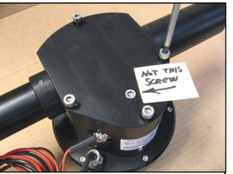
Unscrew 4pcs of screw. NB!! Do not dismount screw in the center, only 4pcs in edge