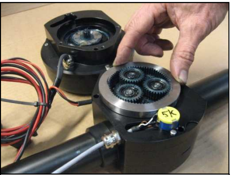
Take gearwheel from top housing and mount it on the gearwheels on bottom housing