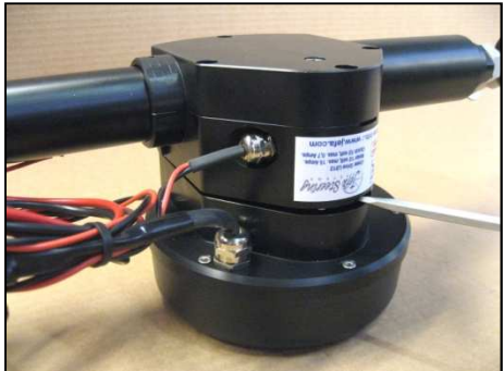
Use flat screwdriver or flat tool to pull housings apart