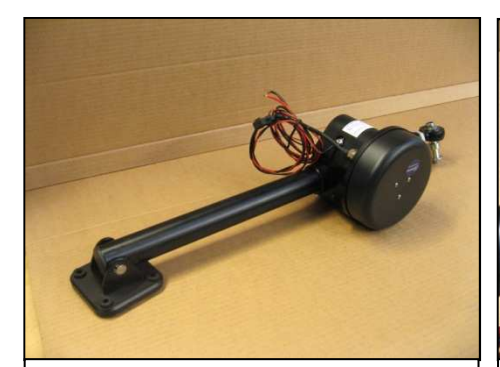
Manual to install rudder feed back in Jefa DU-LD-12