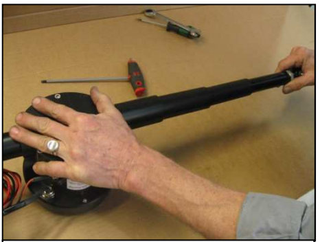
Pull drive arm out to stop