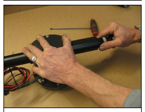
Push drive arm in to stop. Installation of the rudder feed back is done.