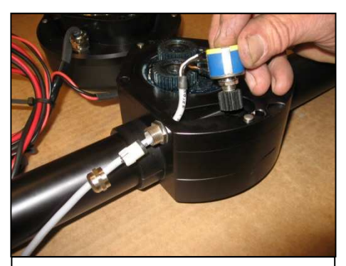
Mount the rudder feed back. NB!!! Do not use hammer on rudder feed back, only use hands