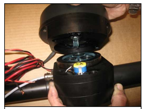
Assemble housings, and make sure that the gearwheels are fitting