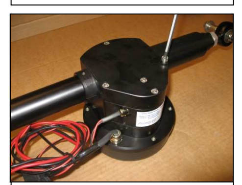
Mount 4pcs of screw to assemble the drive unit